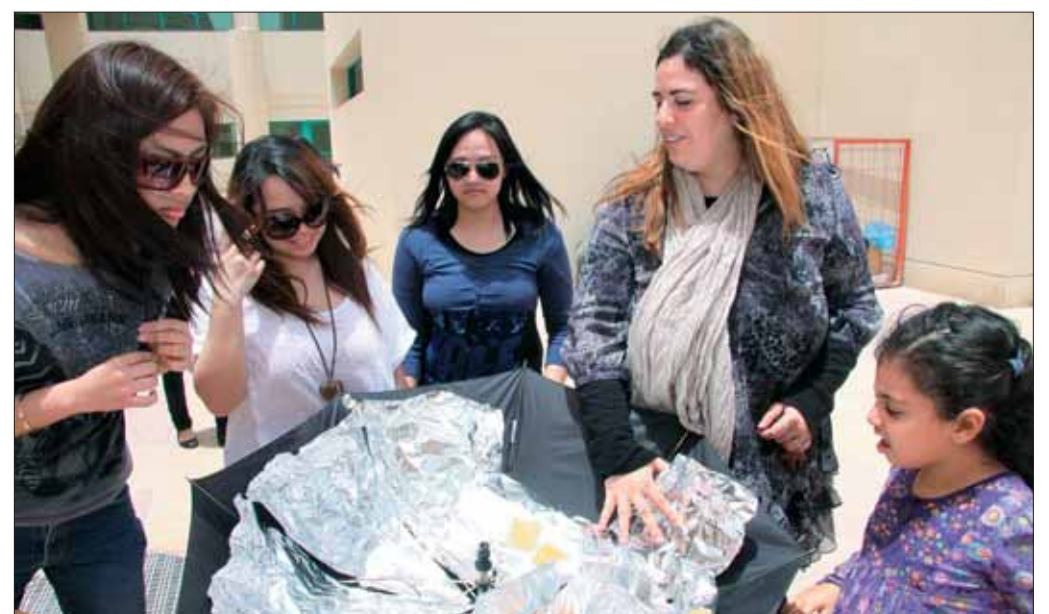
Students of UCQ during the 'Solar Bake Sale' programme, in Doha, recently.

ference on how electricity pollutes, the UCQ student's 'Solar Bake Sale' is a timely reminder of the other environmentally safe options that are available.