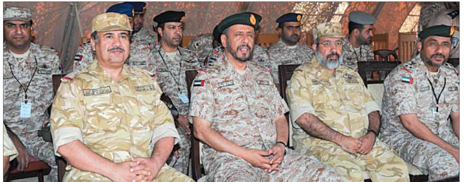
Military officers at a joint exercise, in the UAE, recently.

the level of the joint coordination of the armed forces and their ability to work harmoniously in various environments of joint operations.