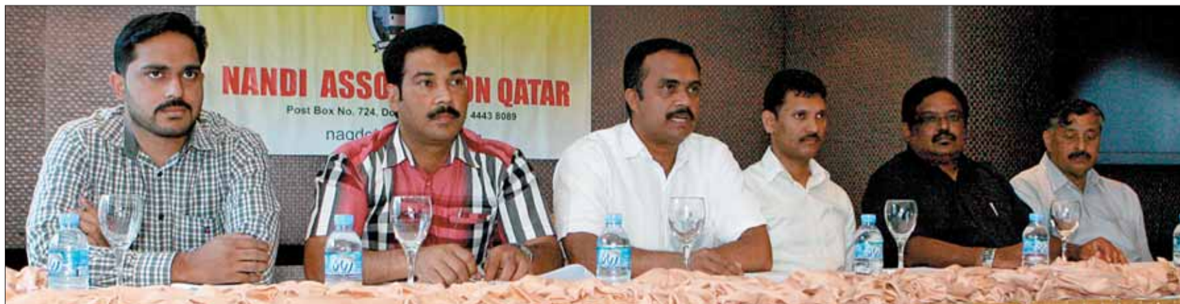
Kerala forum members at a press conference, in Doha, on Monday.

The forum will also offer financial assistance for the purchase of an ambulance in their home village back in Kerala.