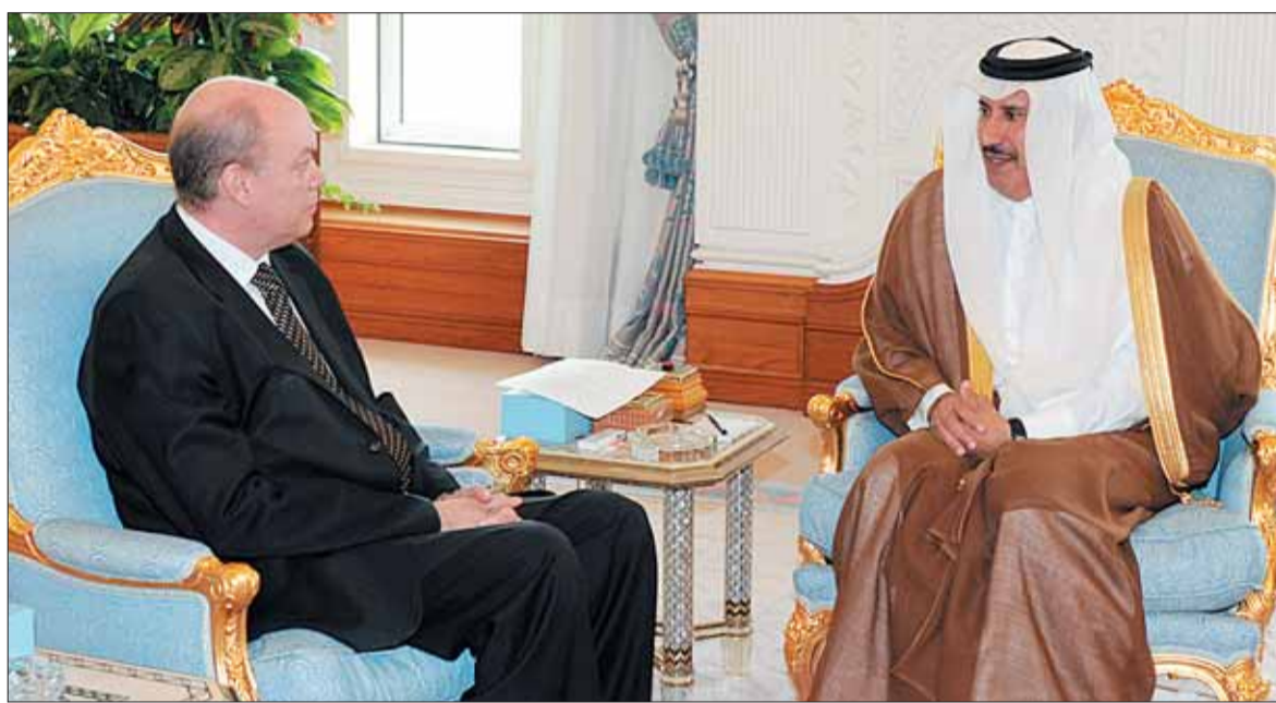
Prime Minister and Minister of Foreign Affairs HE Sheikh Hamad bin Jassim bin Jabor al Thani with Cuba's Minister of Foreign Trade and Foreign Investment Rodrigo Malmierca Diaz, in Doha, on Tuesday.